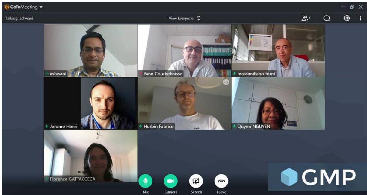
The board during its annual meeting

All GMP board members committed themselves to maintain a high spirit of work and actions during this COVID-19 pandemic. Hence, GMP board organized its first " virtual Face-to-Face " meeting on July 3 rd 2020 and made action plans for the upcoming virtual conference of GMP 2020, organization of the future face-to-face GMP 2021 symposium at the Institut Pasteur in Paris (see announcement below), but also started to prepare GMP 2022 symposium. A brief focus was made on the functionalities required for the remote votes during the 2020 general assembly. The board finally discussed the action plans for organizing workshops with industrial and academic members, webinars hosted by GMP and publication of the present newsletter !